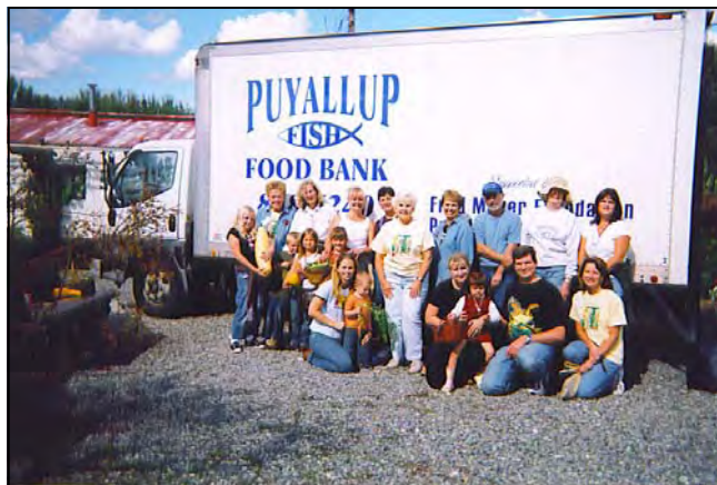
Donating Food Grown for the Food Bank