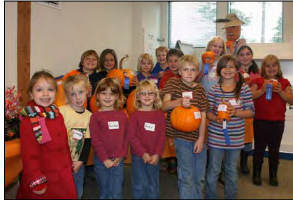
2008 Pumpkin Contest Winners

Special arrangements can be made for groups such as school classes, 4-H groups, home-schoolers, and other organizations. FOR MORE INFORMATION CALL: Master Gardener Office: 253.798.7170 or Email piercemastergardeners@wsu.edu