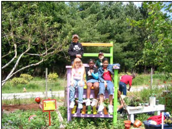
Together in the Giant's chair